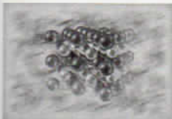
Original illustration courtesy of Raymond Schick